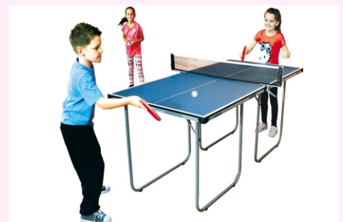
Table Tennis is another area of games and sports where the young children can venture and show their skills as the school caters to their needs providing six TT tables to enable more participation from all quarters. Children will benefit from learning its important skills at an early age, which will increase the likelihood of enjoying table tennis throughout their lives. Table Tennis demands the extensive use of hand/eye co-ordination exercises and establishes a solid foundation for future skill development.